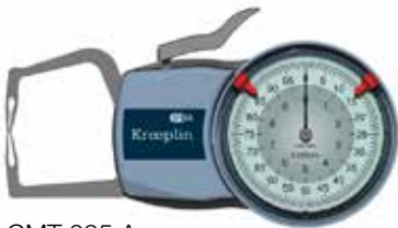
CMT 035 A