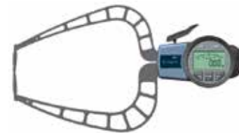
CMT 167 D