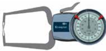
CMT 085 A