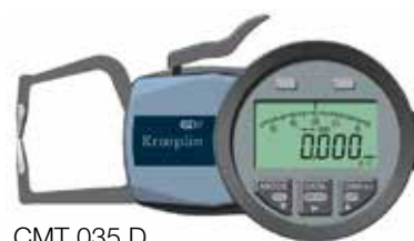
CMT 035 D