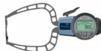
CMT 116 D